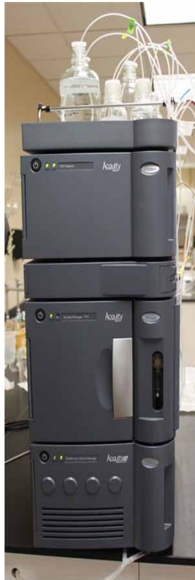
HPLC Testing Machine - Outside