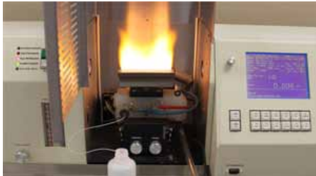
Atomic Absorbance Spectrometer